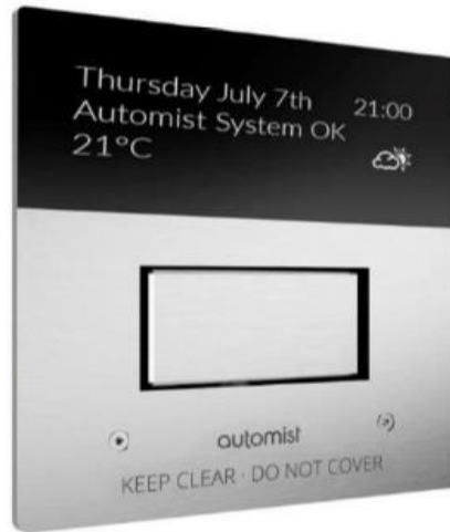
Figure 2 - Plumis Automist Smartscan 2.0

For example, we can fix the device to utilise the heat sensors that activates the system to efficiently control the temperature of one's home.