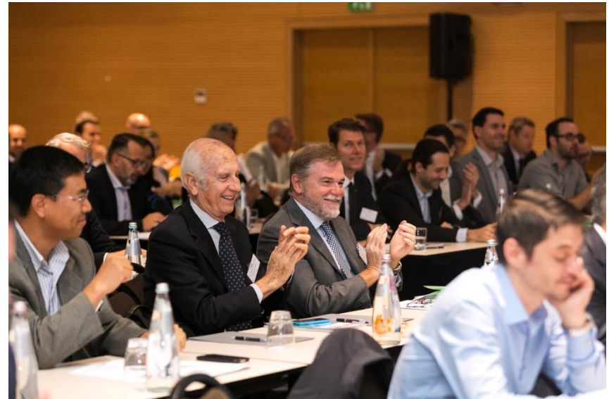
17th IWMC in Rome in 2017