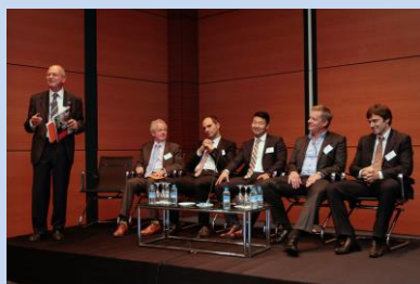
Last year in Istanbul ...

campaign. If you would like to become a sponsor, please inform the IWMA headquarter by 1 st July 2015 to make sure that your logo