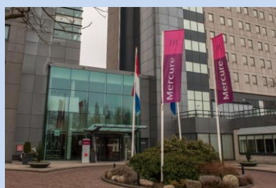
The Conference Hotel 2015

directors wishes to remind you that all important details can be downloaded