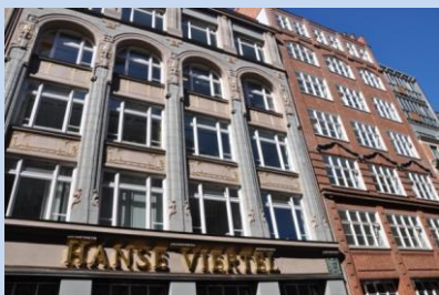
The IWMA Headquarter in Hamburg

Please get in touch with the IWMA headquarter in Hamburg, if you have a request, a suggestion or a complaint!