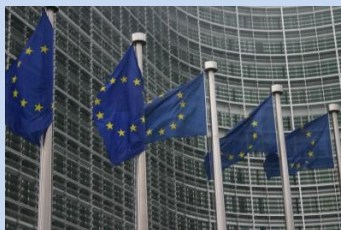
The European Commission

IWMA now also supports the work of the European Commission. IWMA has been granted observer status with the Expert Group on Marine Equipment. And: IWMA has been assigned to a first task: The job is to collect information which will help the European Commission to renew