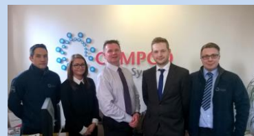
The Compco team in their head office in Worcester, UK

skills for – amongst others – low and high pressure water mist systems. Compco has