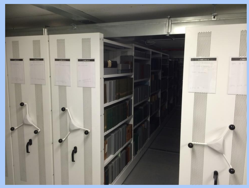
The Bodleian Library Oxford University, UK