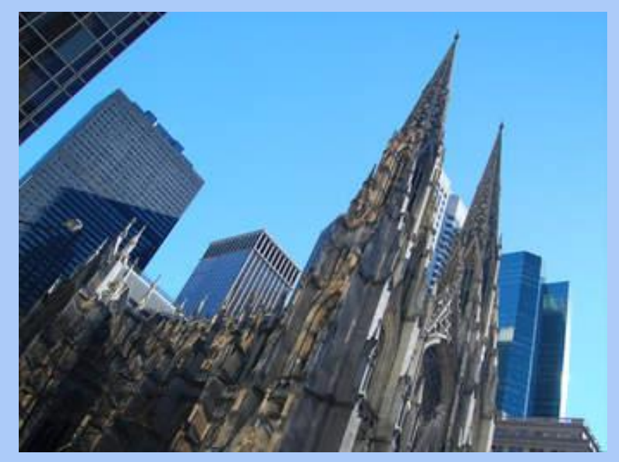
St. Patrick's Church, New York