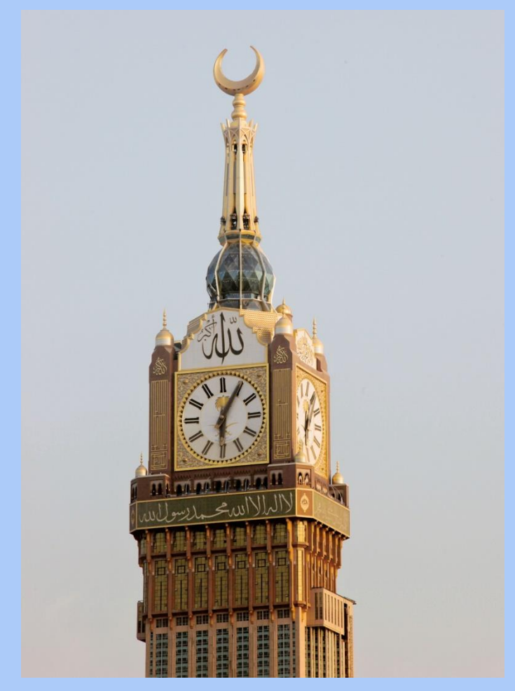
The Clock Tower in Mecca