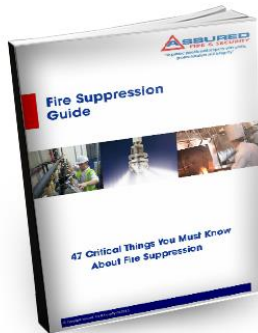
Fire Suppression Guide