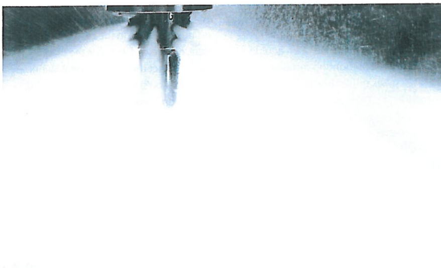
▼ A water mist nozzle.