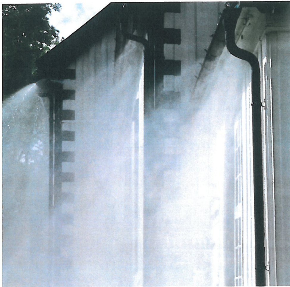
◀ Water mist protects the outside of a wooden building.